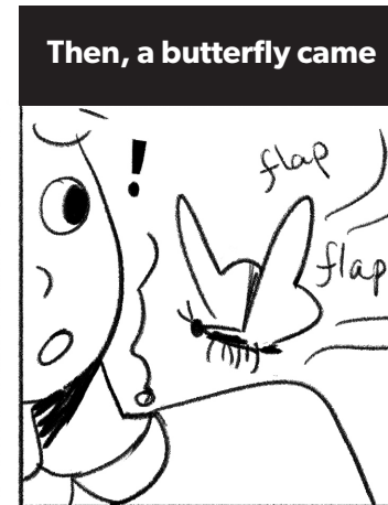
2. Something happens!