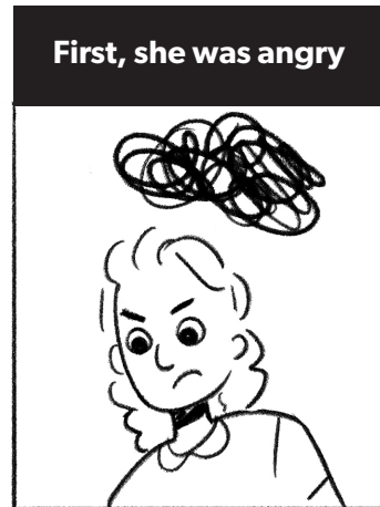
1. Character feels strong emotion

LAST , draw the same character, but feeling a new emotion .